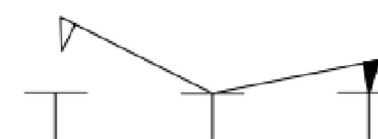
ON - OFF - ON